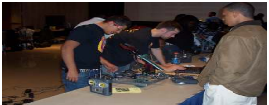
(Pictured above: Patterson students preparing their project for competition at Morgan State University)